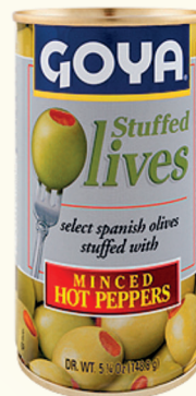
Stuffed olives with Minced Hot Peppers