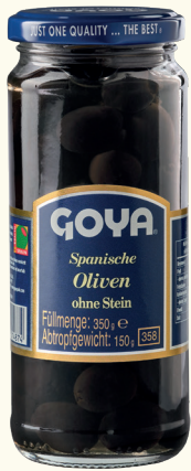
Black Pitted Olives

We follow the so-called “Californian Style” in their production, to obtain a black olive with a smoother tone on its interior, more intense and darker on its exterior appearance, and completely uniform.