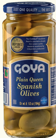
Green Whole Plain Queen Olives