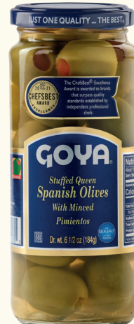
Stuffed Queen Olives with Minced Pimientos