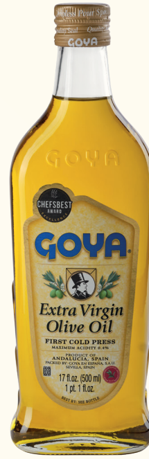
Extra Virgin Olive Oil