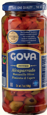
Pitted Alcapparrado Manzanilla Olives, Roast Pimientos and Capers