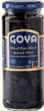
Black Sliced Olives