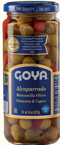
Alcapparrado Manzanilla Olives, Roast Pimientos and Capers