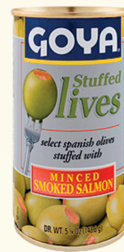
Stuffed Olives with Minced Smoked Salmon