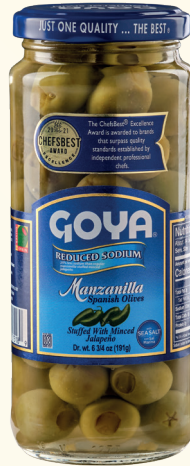
Green Manzanilla Olives Stuffed with Minced Jalapeño