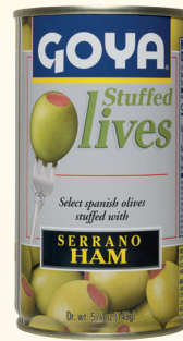
Stuffed Olives with Serrano Ham

A quality and variety of fillings, with the incomparable flavor of the green manzanilla olive.