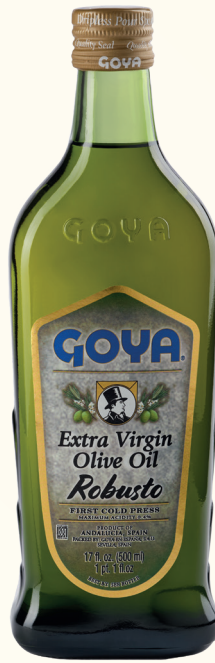
Robusto / Fruity Extra Virgin Olive Oil