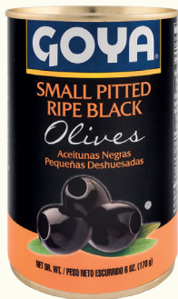
Small Pitted Ripe Black Olives