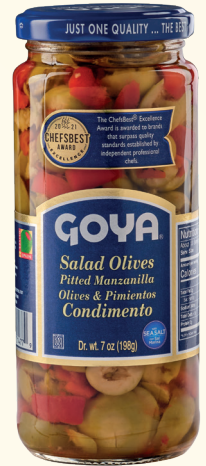
Salad Olives Pitted Manzanilla Olives & Roast Pimientos. Condimento