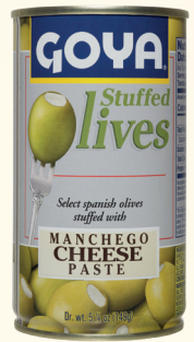
Stuffed Olives with Manchego Cheese Paste