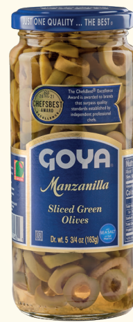
Sliced green Manzanilla Olives