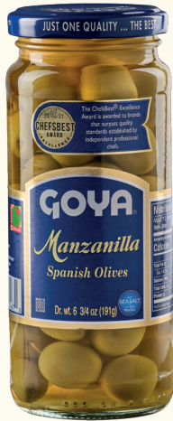
Green Whole Manzanilla Olives