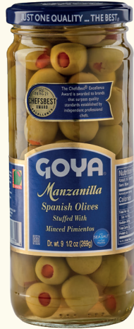
Green Manzanilla Olives Stuffed with Minced Pimientos