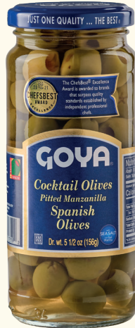
Cocktail Olives Green Pitted Manzanilla Olives