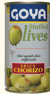
Stuffed Olives with Spicy Chorizo