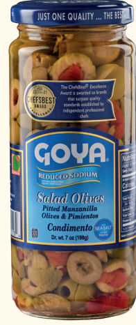
Salad Olives Pitted Manzanilla Olives and Pimientos