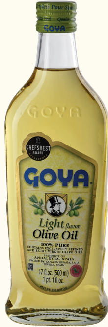
Light Flavor Olive Oil