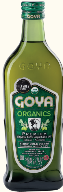
Organics Premium Extra Virgin Olive Oil