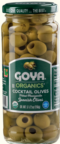
Cocktail Olives pitted manzanilla Spanish Olives