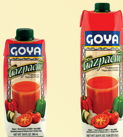
Gazpacho 500 ml

Obtained based on the production model for our olive oils: Balance. With a shelf life of one year, our Gazpacho can compete with other fresh gazpachos in blind tastings.