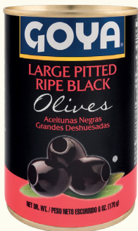
Large Pitted Ripe Black Olives