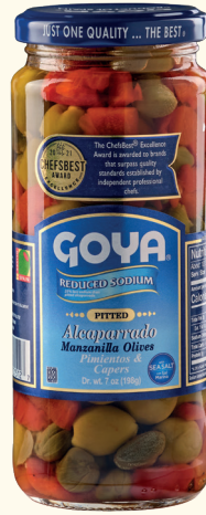
Pitted Alcaparrado Manzanilla Olives, Pimientos and Capers