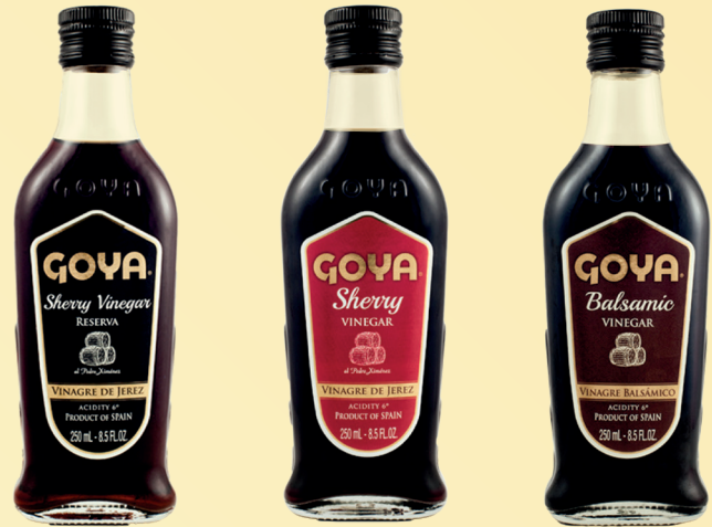
Sherry Vinegar Reserva "al Pedro Ximénez"

The ideal dressing on plates and desserts brings to the table the essence of the wines of the frame of Jerez. Appellation of Origin. Balsamic Vinegar also available.