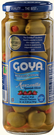
Green Manzanilla Olives Stuffed with Minced Pimientos