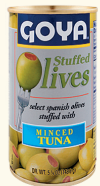
Stuffed Olives with Minced Tuna