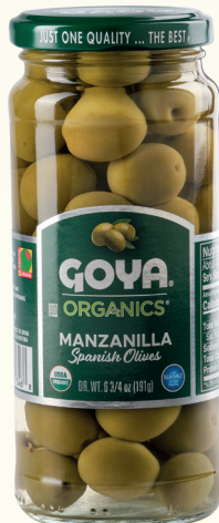
Manzanilla Spanish Olives