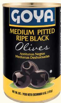
Medium Pitted Ripe Black Olives