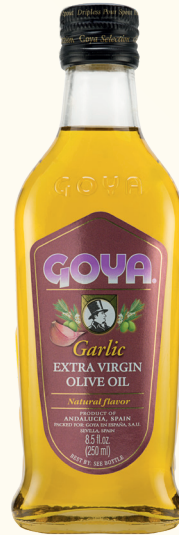
Garlic Extra Virgin Olive Oil