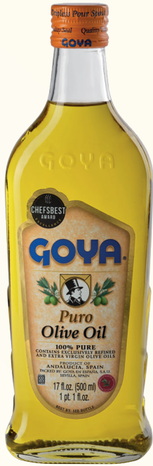
Puro Olive Oil