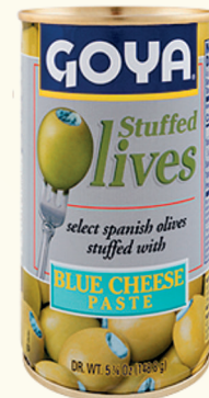
Stuffed Olives with Blue Cheese Paste