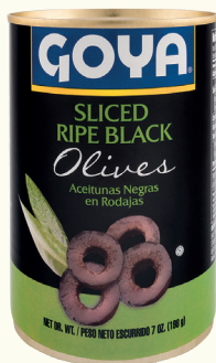
Sliced Ripe Black Olives