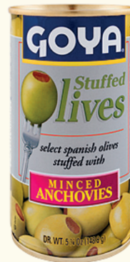
Stuffed Olives with Minced Anchovies