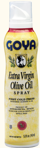
Extra Virgin Olive Oil in Spray