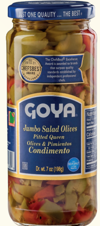
Jumbo Salad Olives Pitted Queen Olives and Roast Pimientos. Condimento