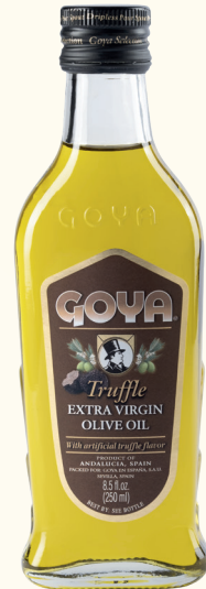
Truffle Extra Virgin Olive Oil