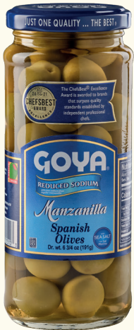
Green Whole Manzanilla Olives

Line of specific products with which we offer our consumers alternatives with a lower sodium content, retaining our incomparable flavour and quality.