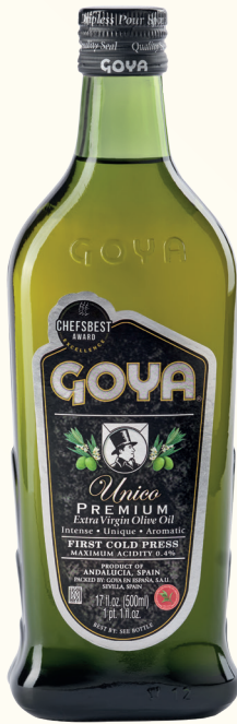
Unico Premium Extra Virgin Olive Oil